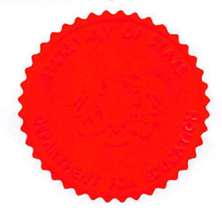
Duly Authorised by the Secretary of State for Education

The Corporate Seal of the Secretary of State for Education hereunto affixed is authenticated by: